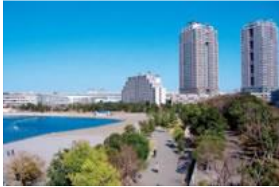
Odaiba Seaside Park