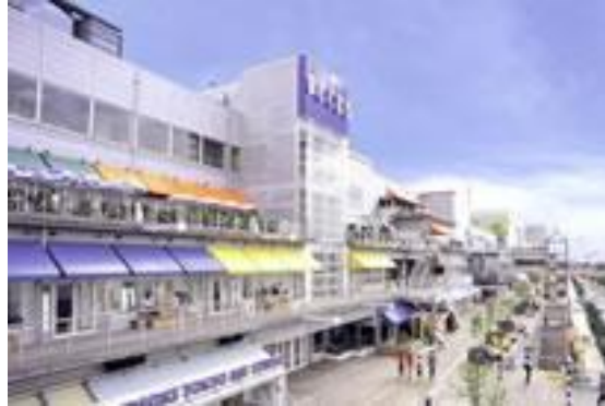
DECKS Tokyo Beach