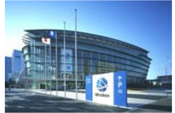
National Museum of Emerging Science and Innovation