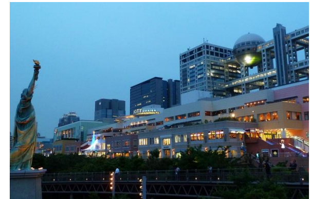
Aqua City Odaiba