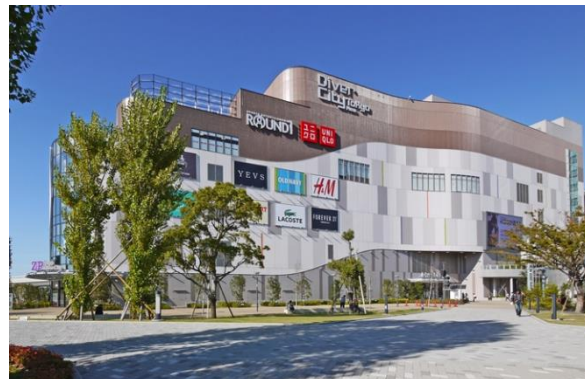
DiverCity Tokyo Plaza