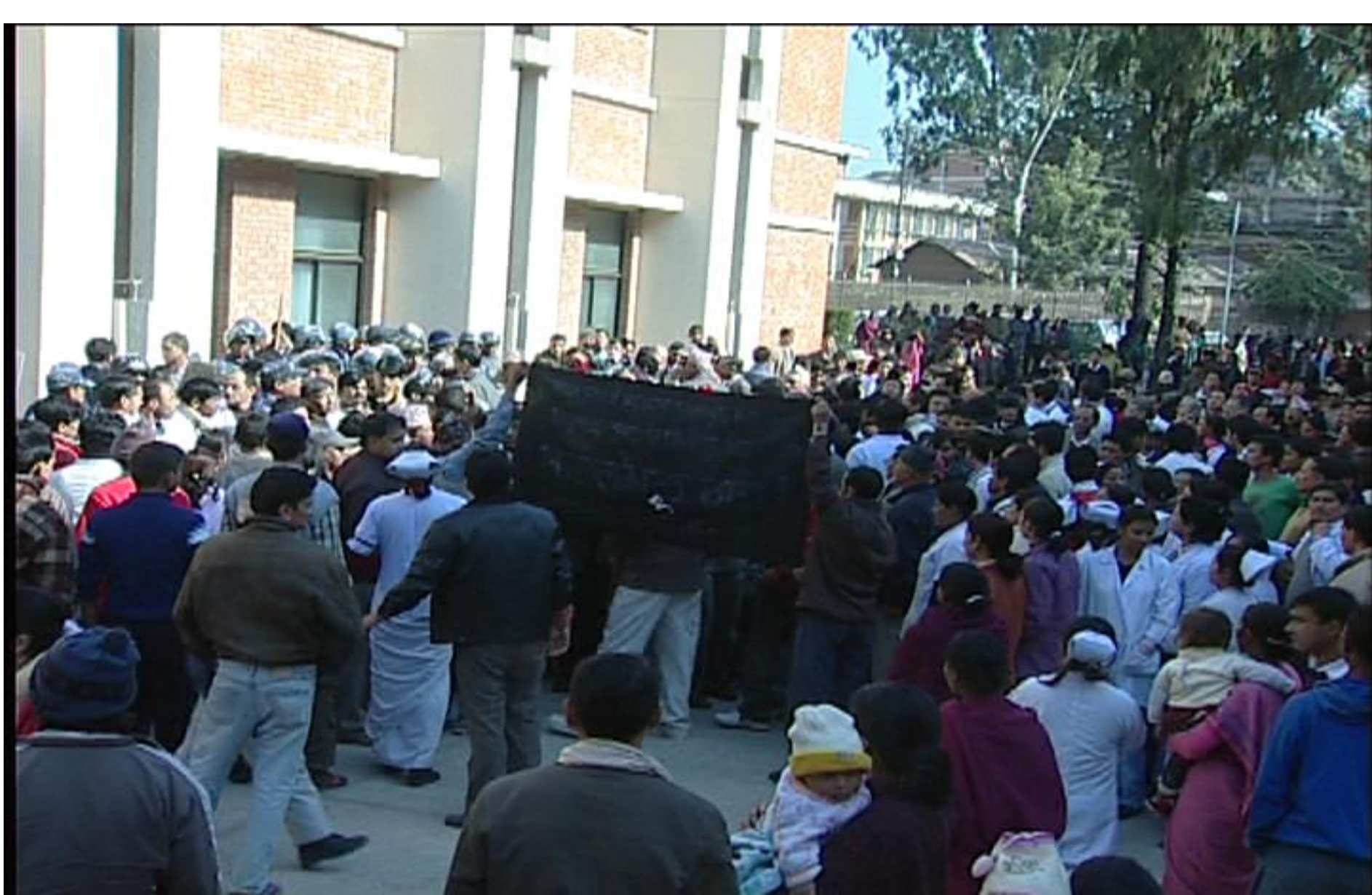
Picture 1. Protest against the perpetrators by the health professionals in Kanti Children Hospital Kathmandu, Nepal .11 September 2011