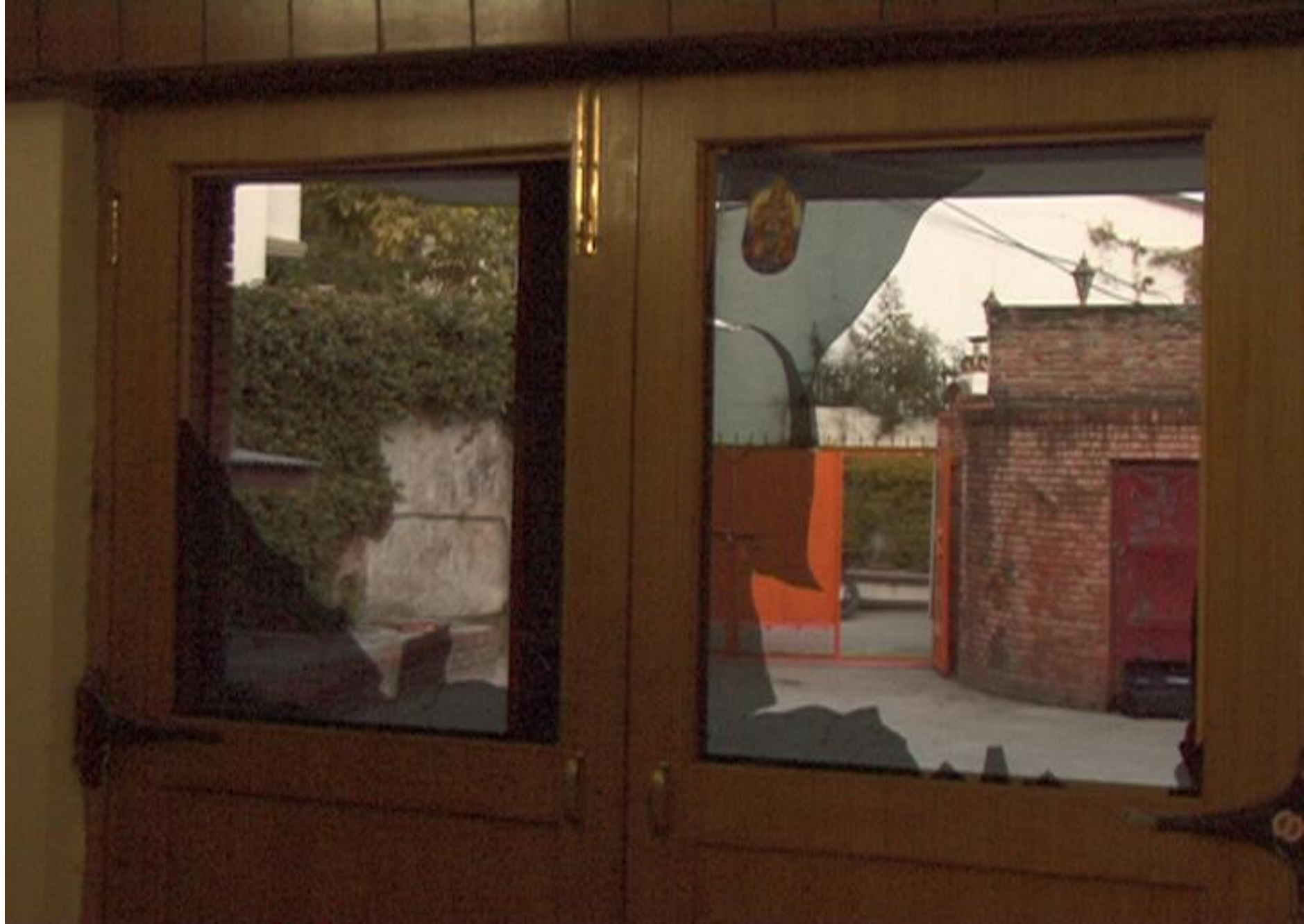
Picture 2. Damaged Infrastructure of health set-up by perpetrators