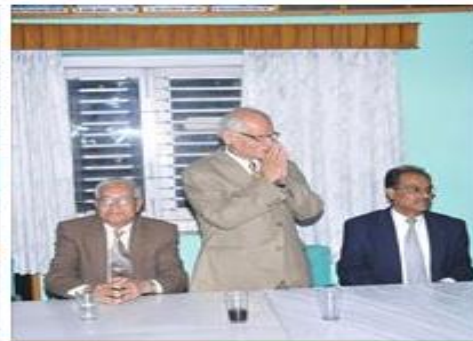
NMA Welcomes New Health Minister