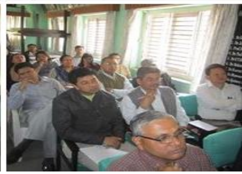
JNMA Training on Scientific Writing