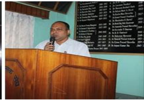
NMA Consultative Meeting on Revision of NMC Act and Regulation