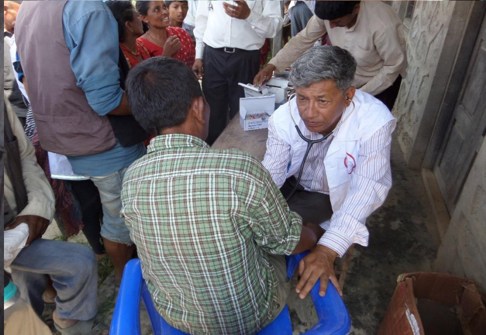
Relief Materials and Health Camp organized in Earthquake Affected Regions