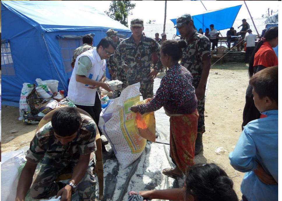
Organized distribution of Relief Materials and Health camps