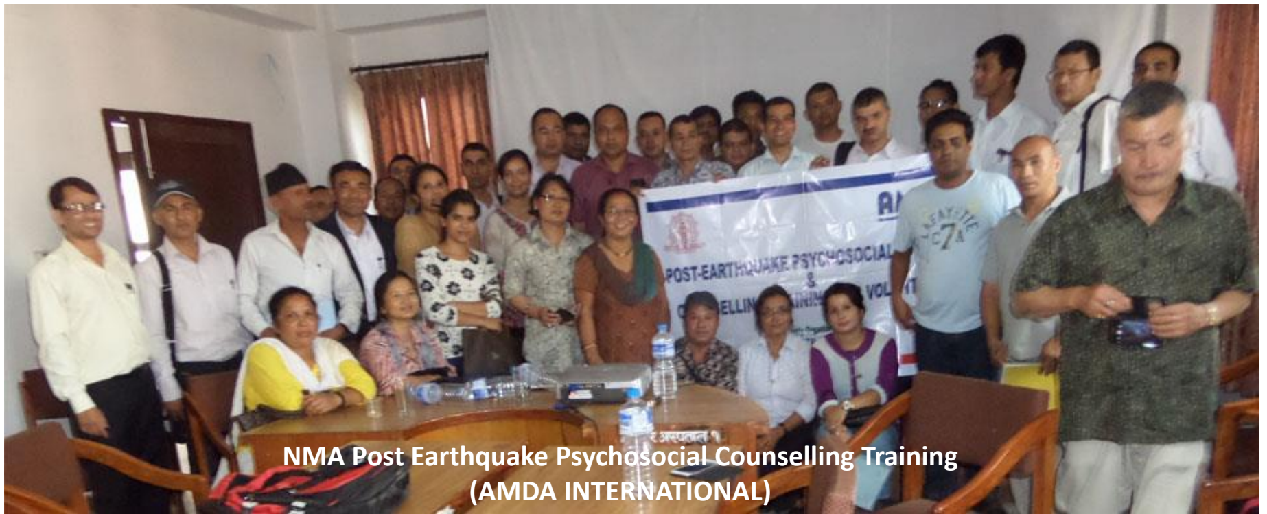
NMA Post Earthquake Psychosocial Counselling Training (AMDA INTERNATIONAL)