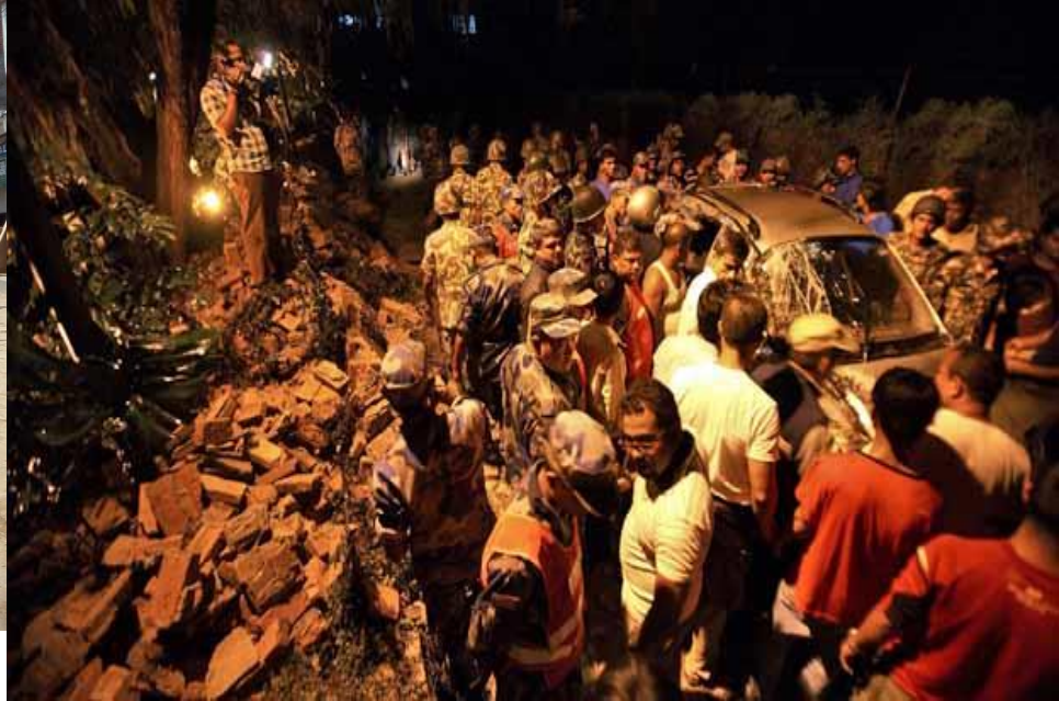
FEW CLICKS of EARTHQUAKE AFFECTED AREAS