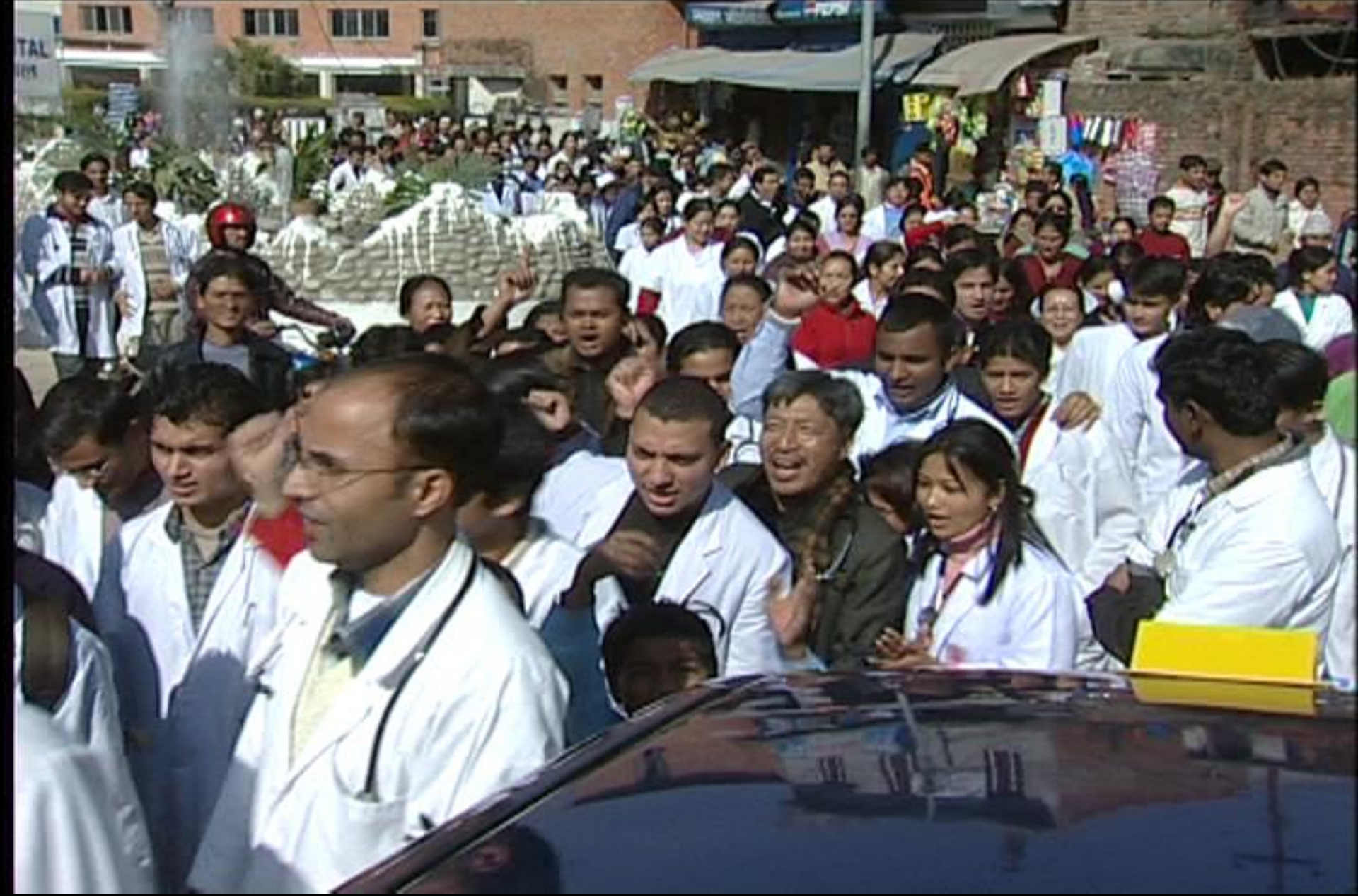
Picture 3. A protest rally organized by health professionals in Tribhuvan University Teaching Hospital, Kathmandu Nepal. 31 March 2010