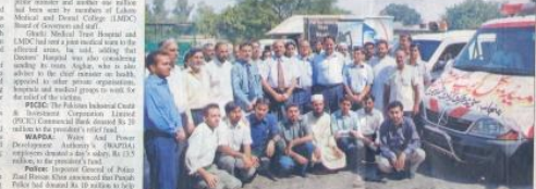
Doctors, nurses and staff to disaster relief camps, Lahore and other parts of the country.

Relief work is being done by the working staff of the relief camps.