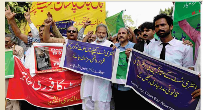
LAHORE: A protest outside the press club against MOCAT paper leak.