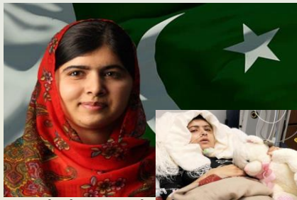
Malala, Nobel Laureate