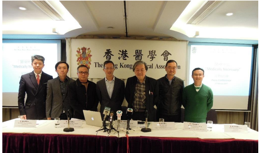
Press Conference: Debate on “Medically Necessary” arising from a letter to doctors from AIA

Although the letter concerned relations between the insurance company and its customers, it was imperative to inform the public that such policy terms was in breach of the right naturally belonged to patients