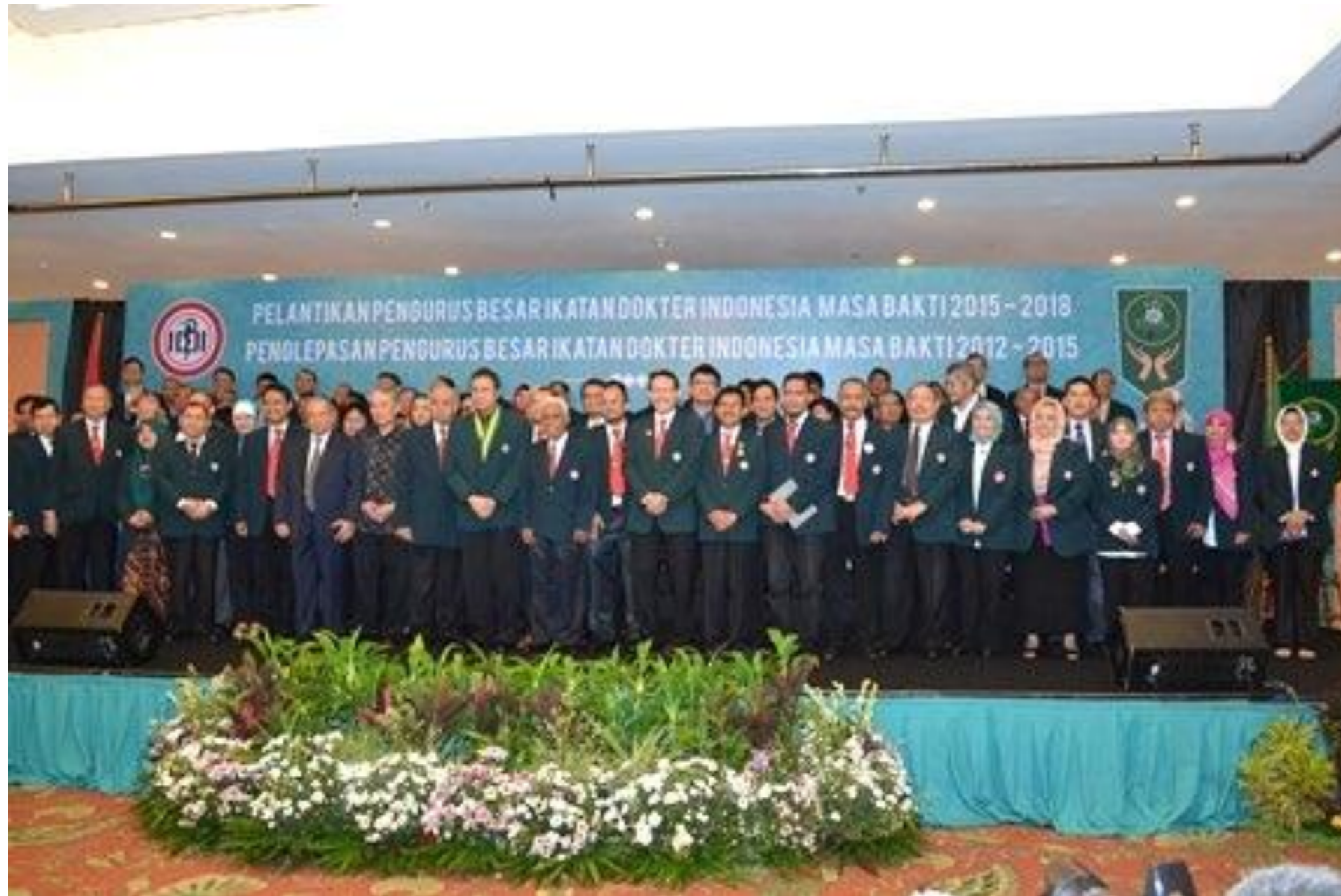
Inauguration of IMA Central Board for the period of 2015-2018