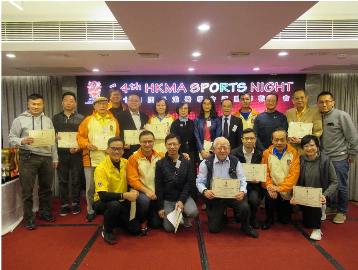
14th HKMA Sports Night