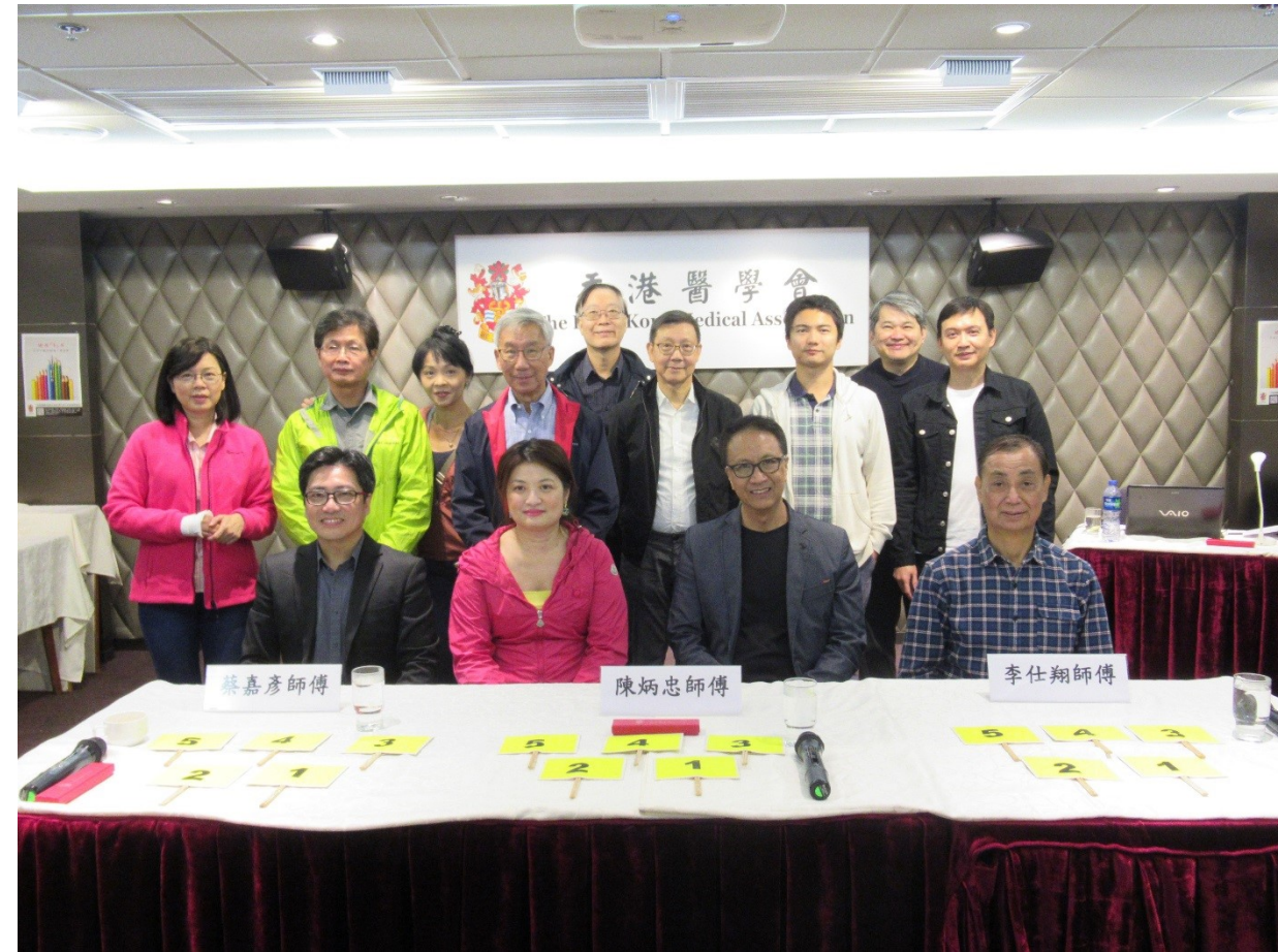
Seasonal Photo Competition & Sharing Session