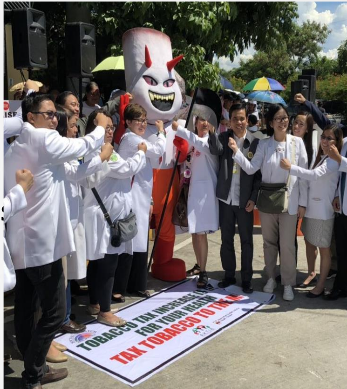
Tobacco UHC Tax

2) Linked with other allied health professionals: Nurses, Medical technologists, Pharmacists