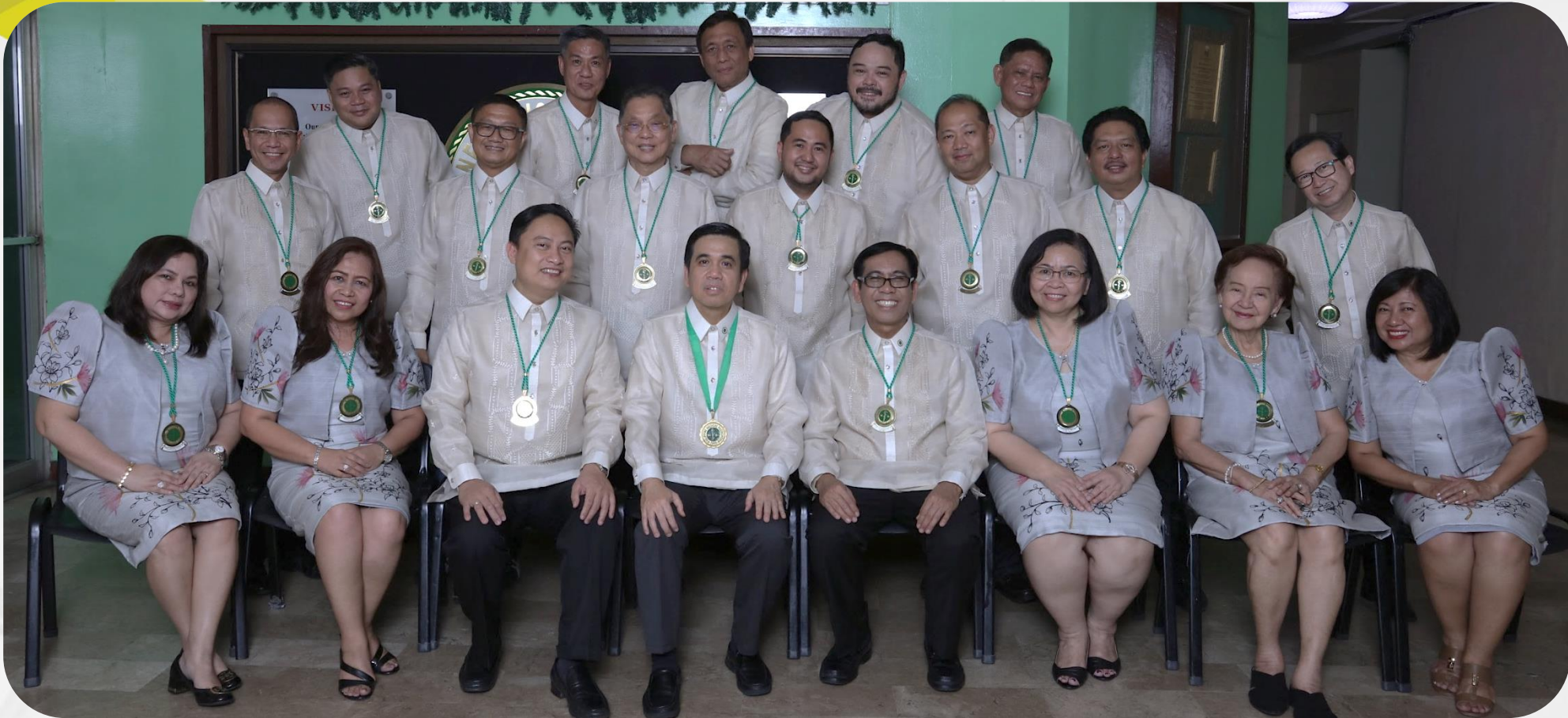
PHILIPPINE MEDICAL ASSOCIATION National Officers and Board of Governors 2019-2020