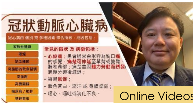
Online Videos: Health Talk