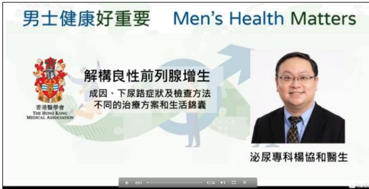
A public talk on benign prostatic hyperplasia (BPH) on YouTube