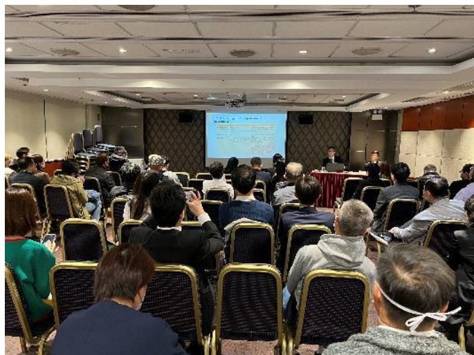
The HKMA Medico-legal Workshop on 25 February 2023