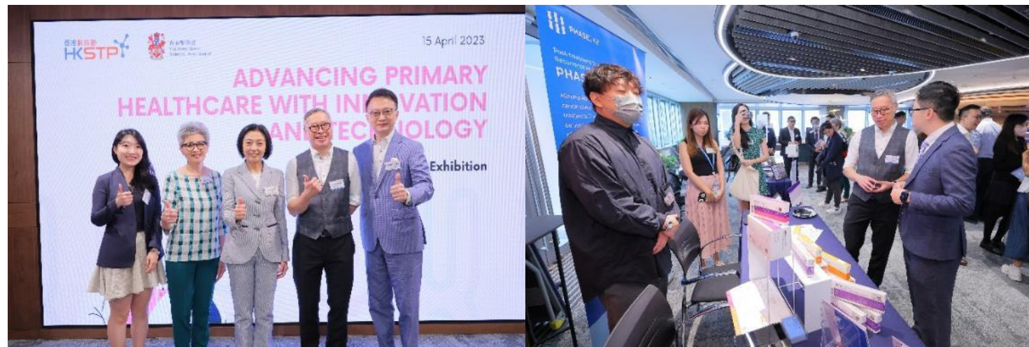
Symposium cum Exhibition "Advancing Primary Healthcare with Innovation and Technology" on 15 April 2023