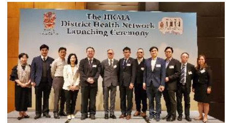
The HKMA DHN Launching Ceremony in April 2023