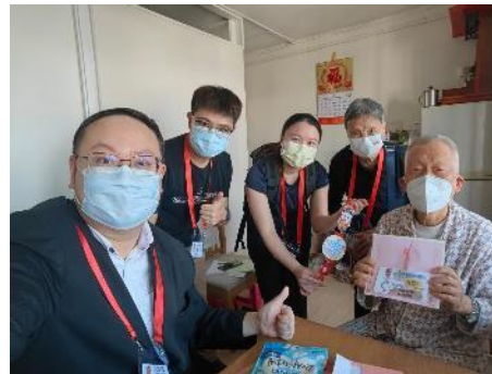
Volunteer Teams for Elderly Home Visit