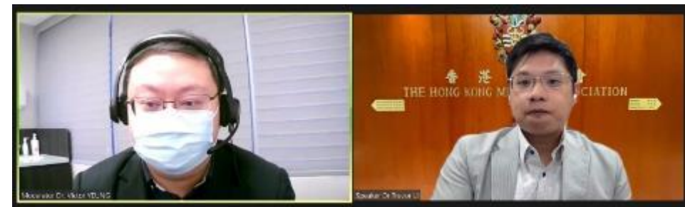
CME lecture on "Updates on Surgical Management of BPH"