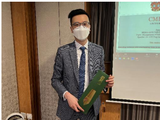
HKMA & Gleneagles Hong Kong Hospital CME Programme on 17 January 2023