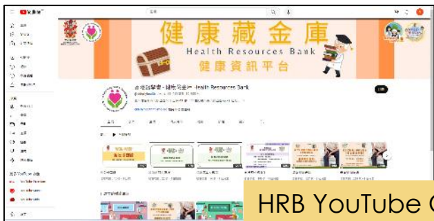
HRB YouTube Channel