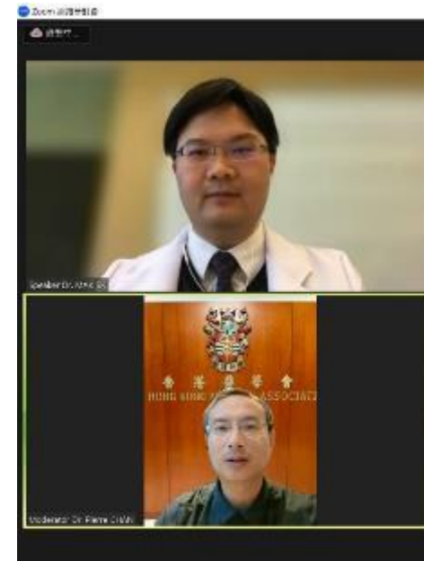
CME lecture on "Management of Erectile Dysfunction & Premature Ejaculation"