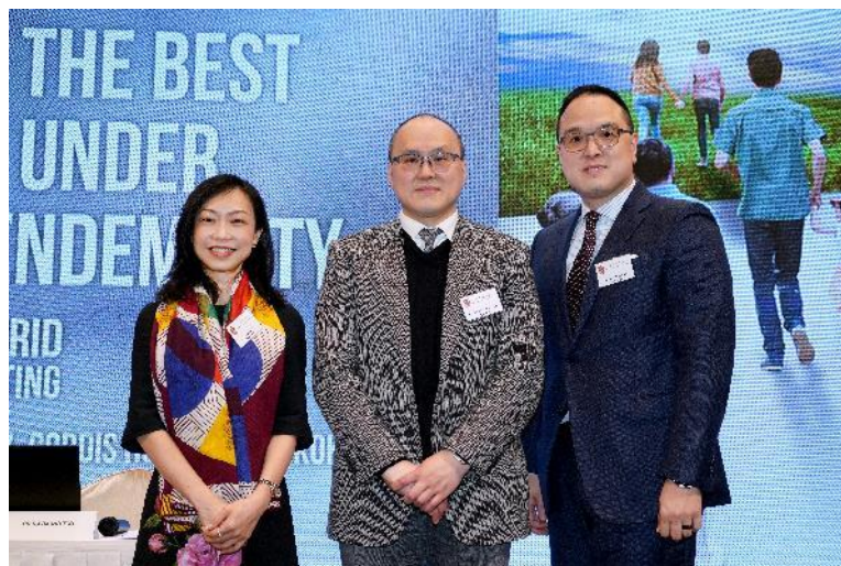
The HKMA and the Hong Kong Society for Infectious Diseases organised the CME hybrid symposium on 4 March 2023