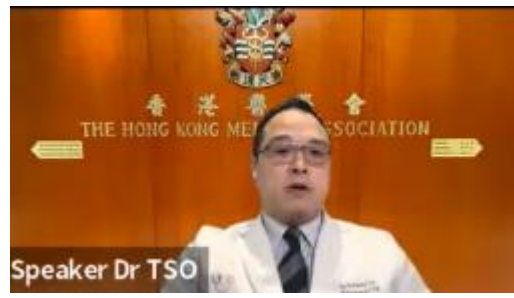
One of CME Live Lectures